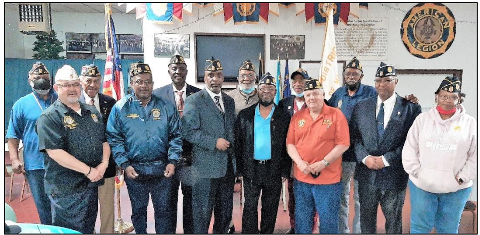
After decades of dedicated service to the community and veterans, the Baltimore District Council concluded our last meeting before merging with the new North Central Region.

While there will be no Legion College , the files from the 2019 classes have valuable information and are available on the Department’s website . Better still, check out the Department Training Resources and Course Videos . Legionnaires can learn more about post administration and leadership, finance and insurance, and the positions of chaplain, judge advocate, and service officer. For more information on the Convention, see the Free State Warrior .