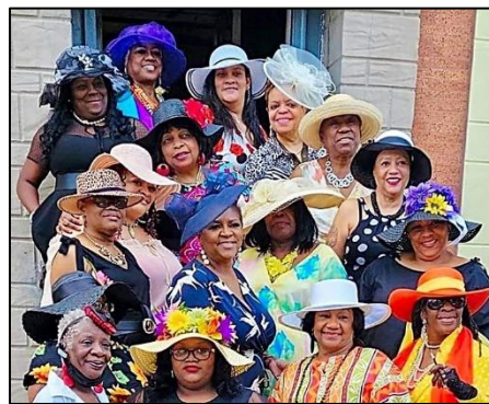
The ladies of Federal Unit #19 show out for a Black-Eyed Susan Gathering at the Post to celebrate the Preakness.