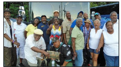
Our Post #19 family fellowshipping with the Randolph Furey Post #170 family during our recent visit to Indian Head.