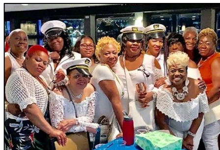
Unit #19 members sail around Baltimore Inner Harbor during their recent Moonlight Cruise fundraiser.