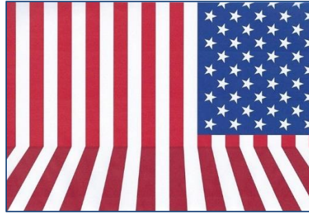
American Legion Federal Post #19 “4 th of July Cookout” Thursday, 3 pm

Detachment Commander’s Challenge for the Four Pillars.