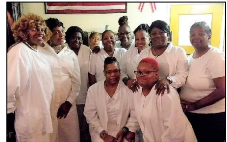
Daughters of Great Southern Temple #30 celebrating our 89 th Anniversary during Open House Week. They look really familiar.