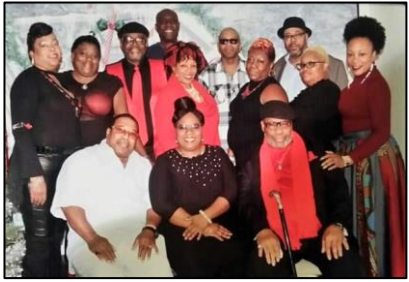
Members of the Federal Post #19 Family support the recent toy drive fundraiser sponsored by the Northeastern Post #285 Family.

This year, because of your generosity, we were able to provide eight Christmas baskets to deserving