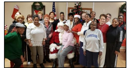
Members of the ALA Baltimore District pose with Santa Claus at the District Christmas Party held on December 13 at Brooklyn-Curtis Bay Post #187.