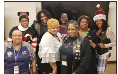
Members of Unit #19 recently volunteered at the VA Hospital, sorting and wrapping Christmas gifts for veterans.