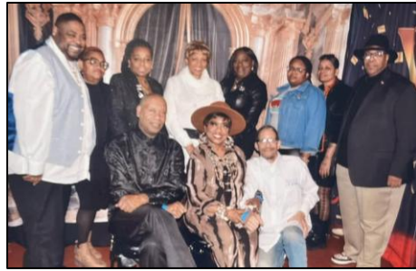
Members of Federal Unit #19 and Squadron #19 attend Northeastern Squadron #285's dance benefitting the Legion Four Pillars.