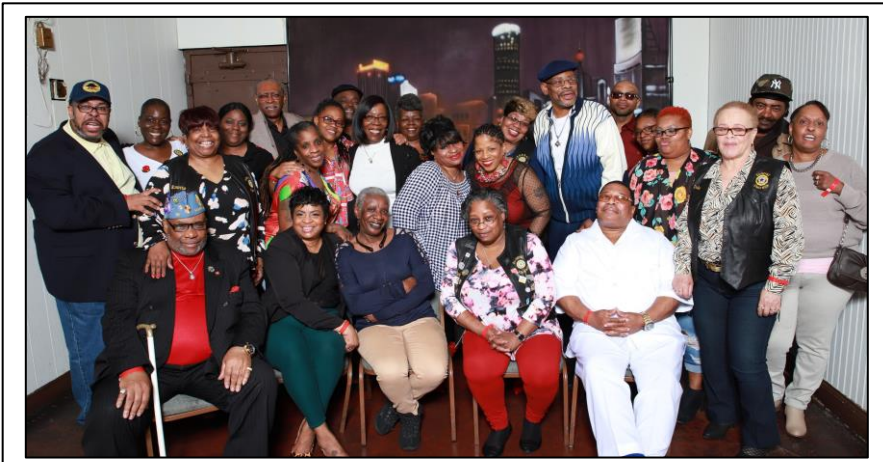
Members of the Federal Post #19 family supporting recent affair hosted by Northeastern Squadron #285.